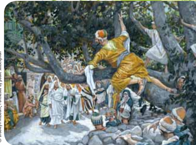
© Brooklyn Museum, Purchased by public subscription

"When he reached the place, Jesus looked up and said to him, 'Zacchaeus, come down quickly, for today I must stay at your house.'" (Luke 19:5)