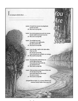
Booklet page 4

When everyone understands the instructions, signal them to begin. You may want to turn on instrumental music selected to create an environment conducive to quiet reflection.