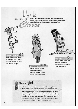
Booklet page 2