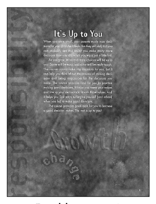
Booklet page 1

1. Give each student four index cards. Ask the young people to write on each card one significant decision they have made recently that relates to one of these four areas of their life: church, school, family, and friends. Urge them to think broadly and to try to identify one decision for each area. It might be necessary to distinguish decisions that are relatively important and those that are not. For example, deciding not to hang around with someone