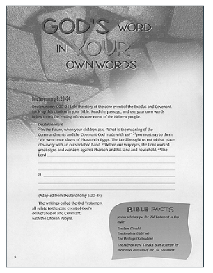
Booklet page 4