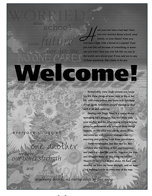
Booklet page 1