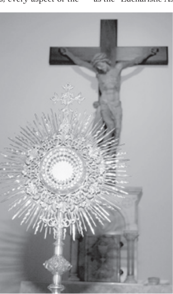
"Christians truly eat the flesh of the Son of Man and drink his blood in the Eucharist."

The name "Sacrifice of the Mass" emphasizes that in the Eucharistic celebration, Jesus' sacrifice of his Body made "once for all" (Heb 10:10) time and all people is truly present. In other words, when we participate in the Eucharist, we join Jesus at the cross.