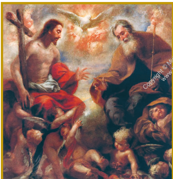
The Holy Trinity by Cairo.