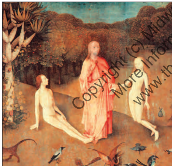
God Presents Eve to Adam (detail from Garden of Earthly Delights ) by Bosch. As originally designed by God, creation was a setting where man and woman could know God and live in his presence.

From the beginning of creation, God desired to gather all mankind into communion with himself. Adam and Eve had been created in communion with God, but they lost this gift when they disobeyed God and ate from the Tree of the Knowledge of Good and Evil. What follows this infamous act in Scripture is the story of God’s efforts to restore the original communion for which mankind had been created. The biblical record of how God’s plan of redemption in Christ unfolded is called salvation history .