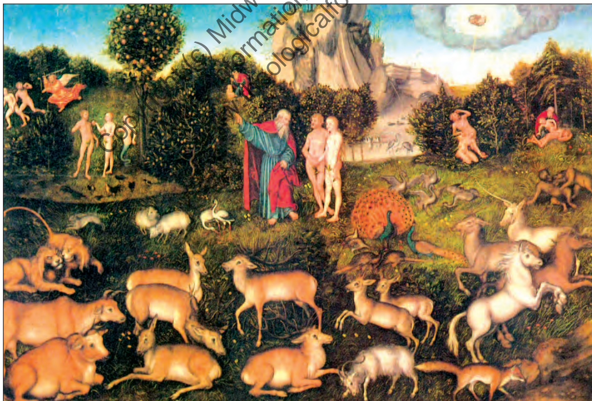
Paradise by Cranach the Elder.

What does Scripture mean when it says that we were made in the "image and likeness" of God? When reading Scripture, it is often best to understand the meaning of a particular word or phrase by looking to