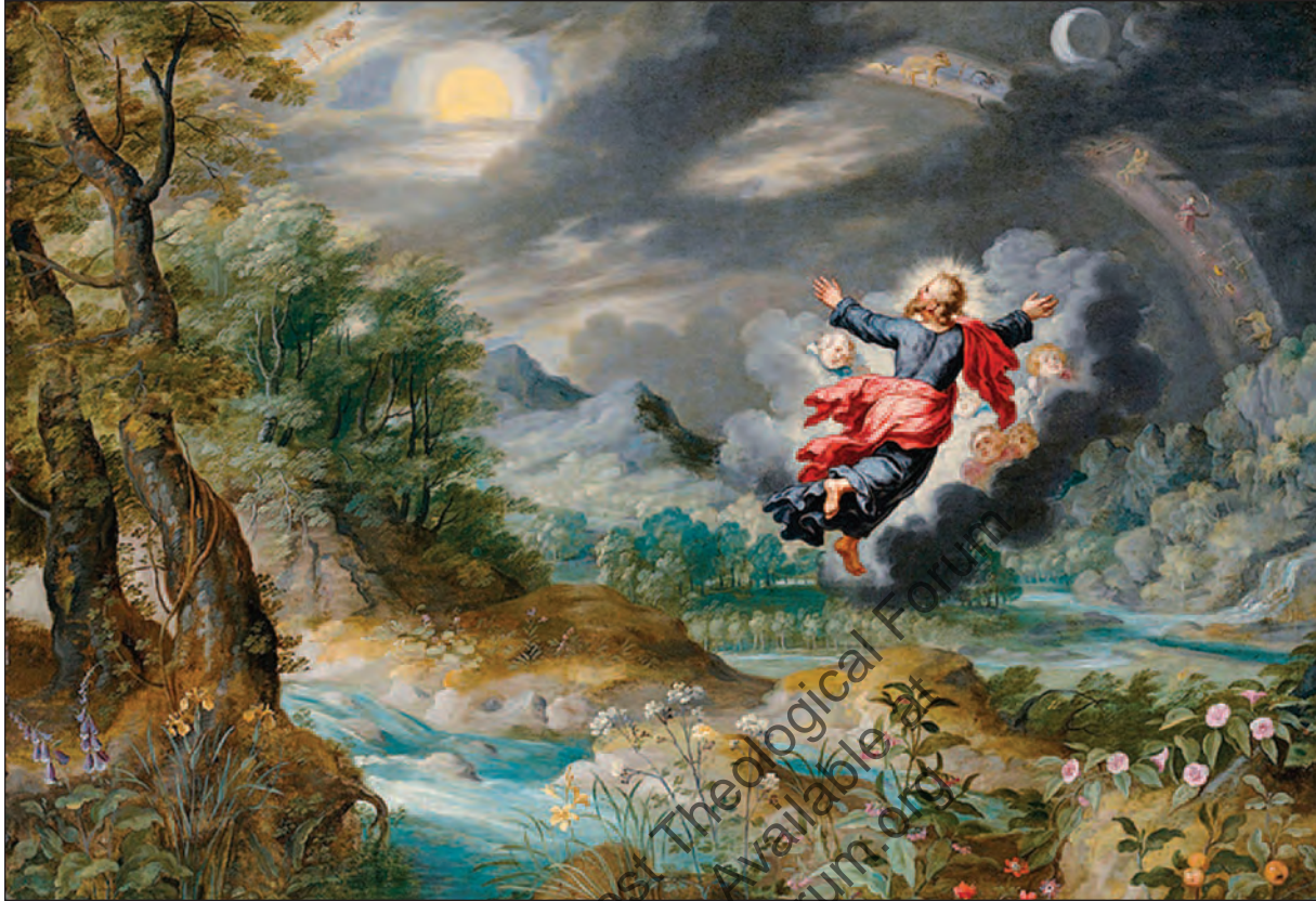
God Creating the Sun, the Moon and the Stars by Brueghel. Created in communion with him, Adam and Eve would enjoy an intimate friendship with God in the paradise that he had created for them.