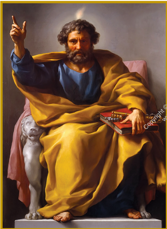
Apostle Peter by Mengs.