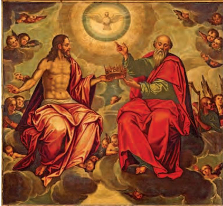
Three persons in one God is the deepest mystery of the Catholic faith.