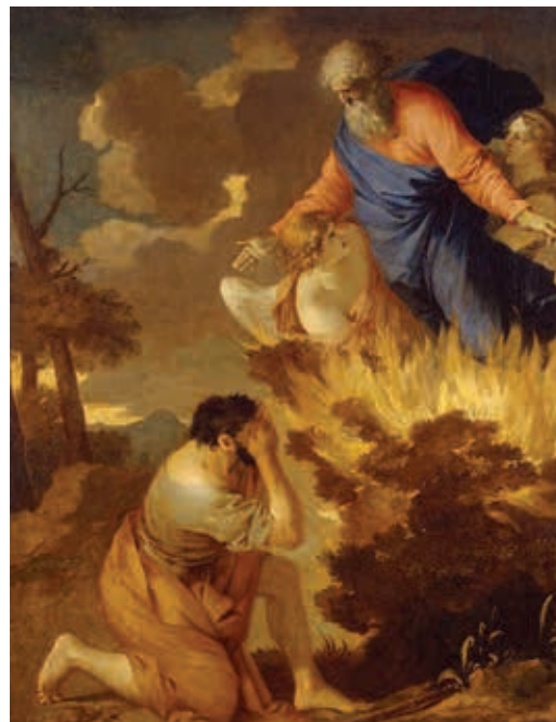
Speaking from a burning bush, God revealed his existence to Moses.

God spoke to Moses more than three thousand years ago. Speaking from a burning bush, God revealed his existence. “God said to Moses, ‘I AM WHO I AM’” (Exodus 3:14). What God meant is that he is existence, or life itself, and that he is the source of all life. God is the one who exists above and before all other persons and things. There is no limit to God’s life.