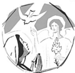
Lk 1:26-38; Isa 7:10-15

Mary, you received with deep humility the news of the Angel Gabriel that you were to be the Mother of God's Son; obtain for me a similar humility .