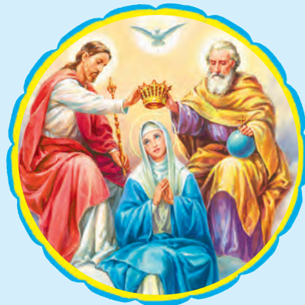
5. CROWNING OF THE B.V.M. For eternal happiness.