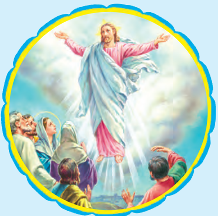
2. THE ASCENSION For the virtue of hope.