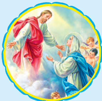
4. ASSUMPTION OF THE B.V.M. For devotion to Mary.