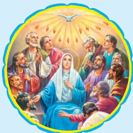
3. DESCENT OF THE HOLY SPIRIT For love of God.