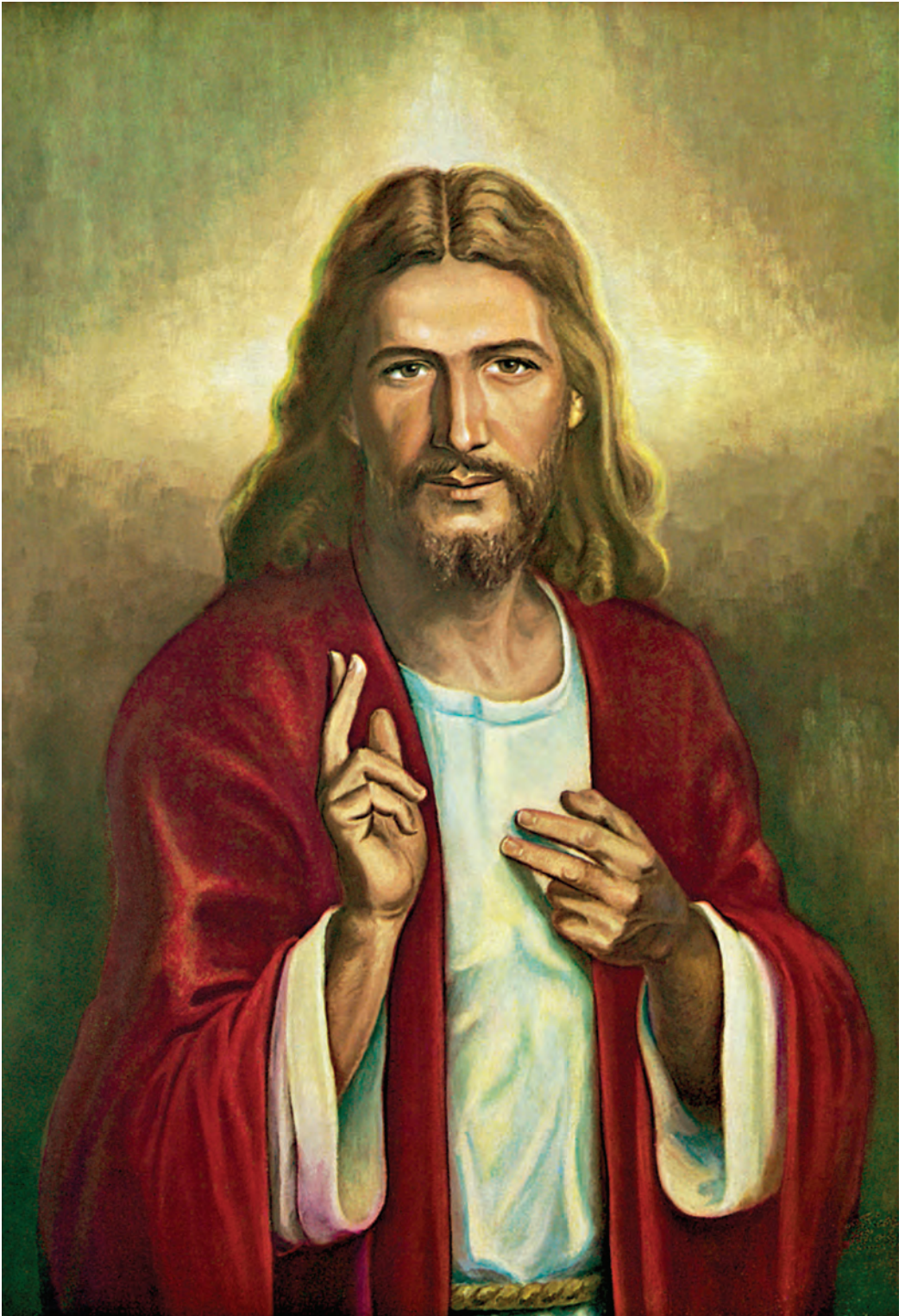
JESUS CHRIST — OUR LORD AND SAVIOR