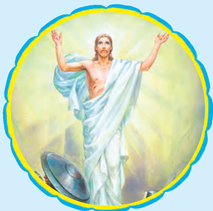
1. THE RESURRECTION For the virtue of faith.