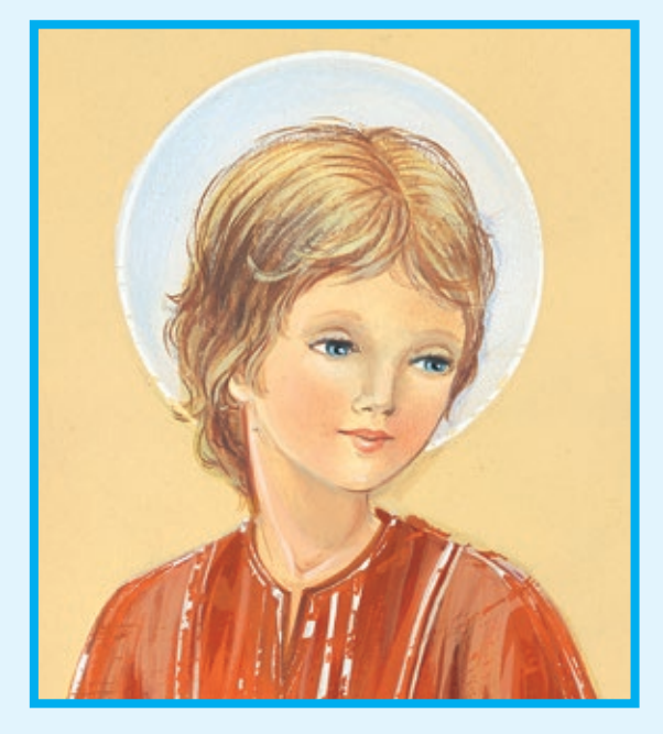
CATHOLIC BOOK PUBLISHING CORP. New Jersey

©1980 by Catholic Book Publishing Corp., Totowa, N.J. Printed in China ISBN 978-0-89942-388-3 CPSIA May 2017 10 9 8 7 6 5 4 3 2 1 L/P www.catholicbookpublishing.com