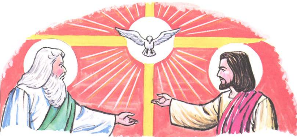
The Holy Trinity — three Persons in one God