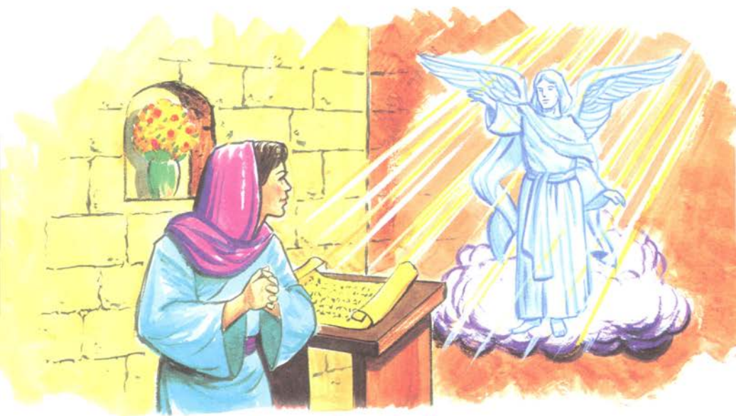
An Angel gave Mary God's message