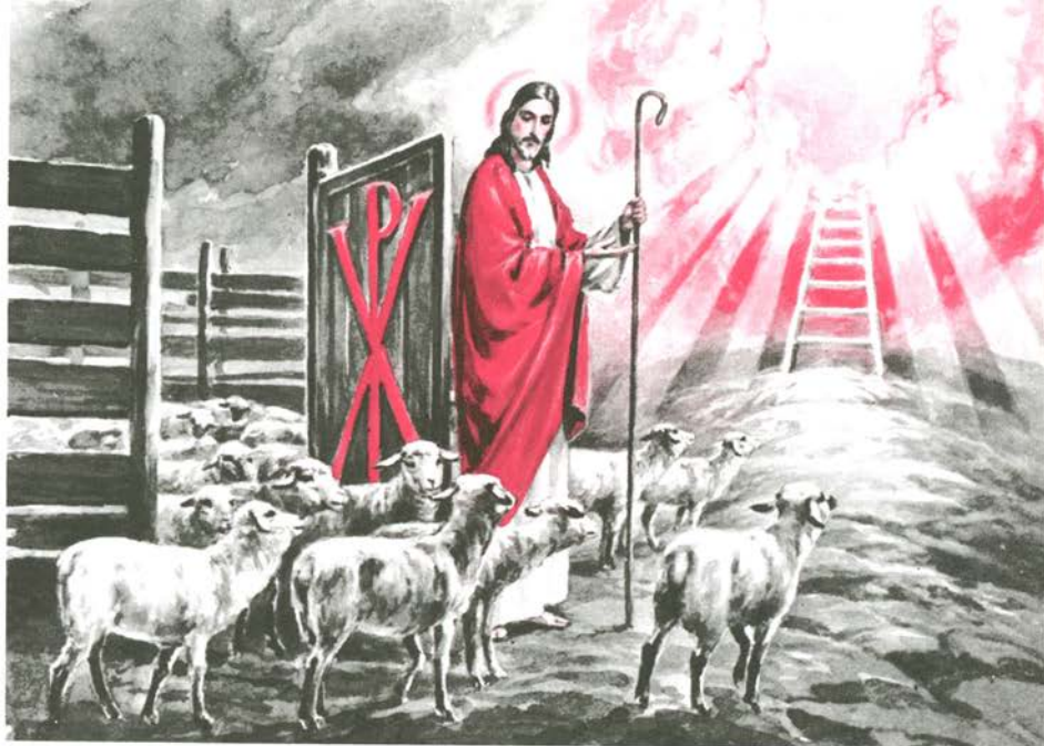
The sheep of Jesus follow Him to heaven