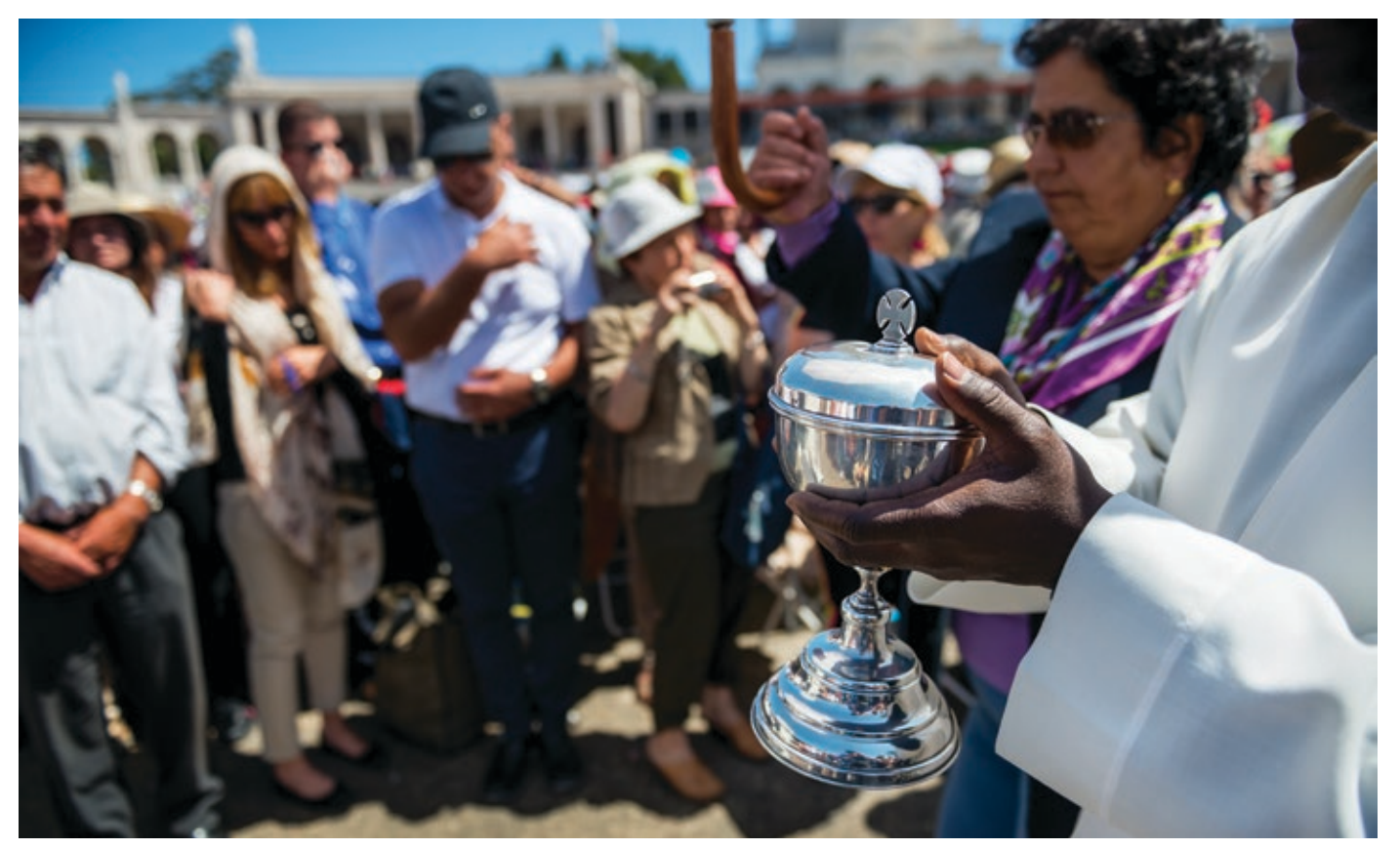
Jesus is present in the lives of the people who make up the Church and especially in the consecrated gifts of bread, shown here in a Eucharistic procession.

studying about any other long-standing human institution, such as a nation or government. When God the Father created the whole universe and then created humans to share in his divine life, he had the Church in mind. She is truly "a plan born in the Father's heart" ( CCC , 759), foreshadowed or "already present in figure at the beginning of the world" ( Lumen Gentium , 2).