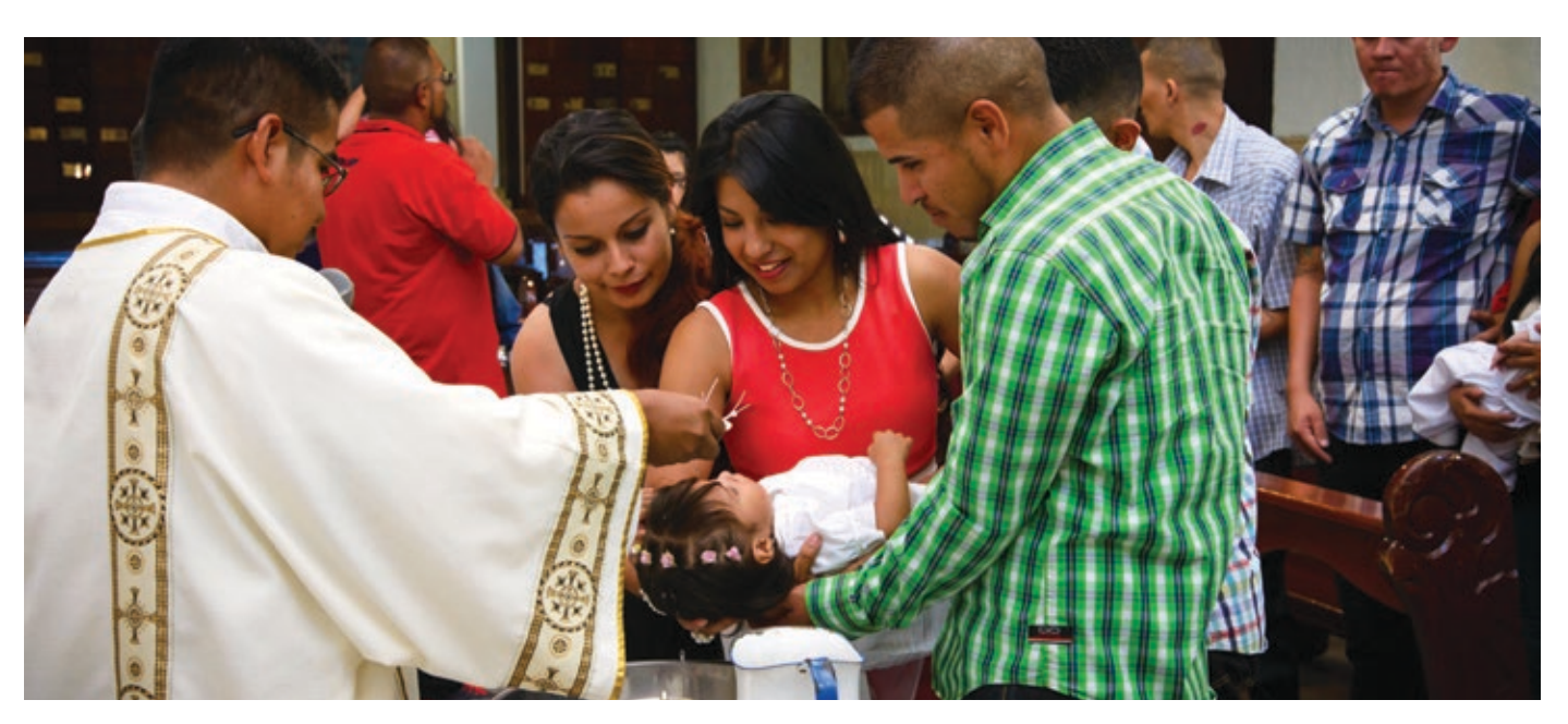
Baptism is the sacrament that incorporates a person into the Church. It is usually celebrated at Mass with the community present.

Paschal Mystery The redemptive Passion, Death, Resurrection, and glorious Ascension of Jesus Christ, through which Jesus not only liberated humans from sin but also gave them new life.