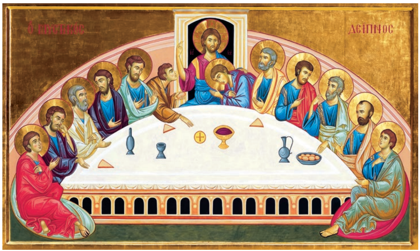
"At the Last Supper, . . . our Savior instituted the Eucharistic sacrifice of his Body and Blood" (CCC, 1323).