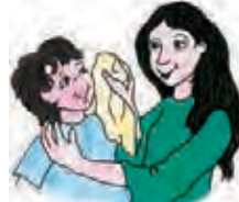
Mary cared for Jesus.

Draw a picture of a person teaching a family member how to do something.