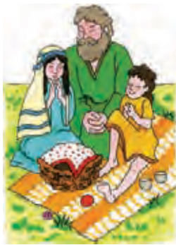
Jesus, Mary, and Joseph prayed together.

Directions: The left side of this page and the next page have pictures showing how Jesus, Mary, and Joseph acted. On the right side draw a picture in the spaces provided showing how a family can act like the Holy Family.