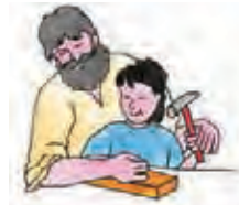
Joseph taught Jesus carpentry.

Draw a picture of a person teaching a family member how to do something.