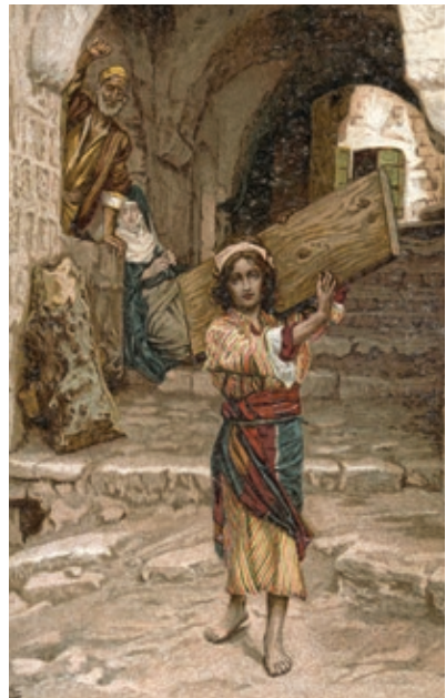
The Youth of Jesus by James Tissot. According to the Brooklyn Museum, which holds the painting, “Anticipating the Passion, in which he will carry the Cross, the young Jesus shoulders a board for use in the shop, while his parents look on with foreboding.”

In the beginning was the Word, and the Word was with God, and the Word was God. He was in the beginning with God.