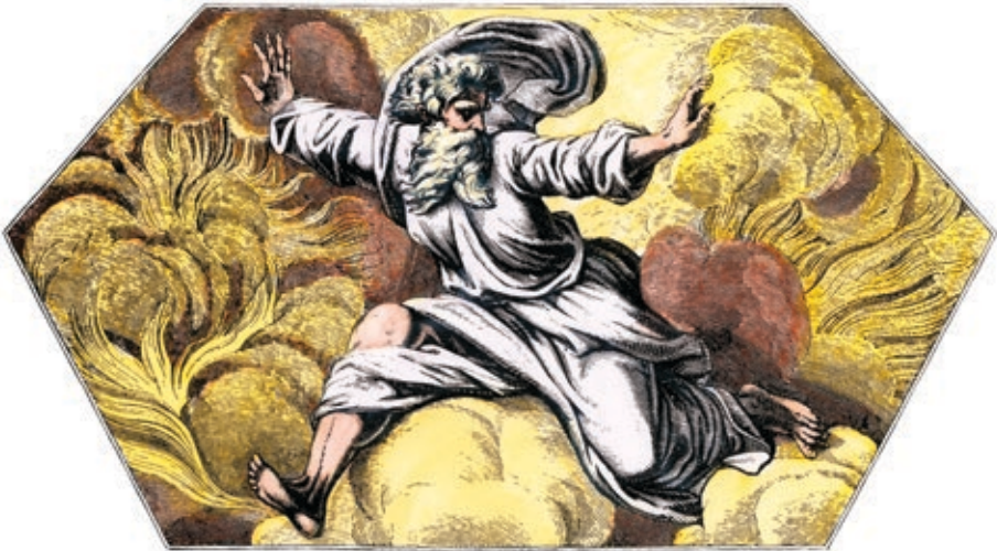
God creating heaven and earth, from the Loggie of Raphael at the Vatican.

You might find the expression “the Word became flesh ” a strange way to state that Jesus became a man. Scholars believe that the Gospel writer selected the word flesh to counteract a first-century heresy — Docetism —that taught that Jesus only seemed to be a man. (The word Docetism comes from a Greek word meaning “to seem.”) Adherents of this heresy simply could not accept