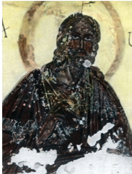
The earliest portraits of Christ come from the tombs found in catacombs below Rome and date from the second through fourth centuries.