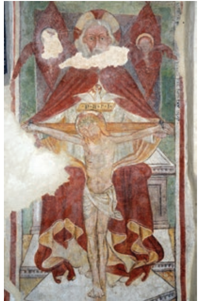
This fresco of the Trinity depicts God the Father holding the crucified Christ, and the Holy Spirit, represented by a dove, rests between them. Frescoes are painted directly on the still-wet plastered surface of a wall or ceiling.

The climax of salvation history was the coming of the Messiah, Jesus Christ, the fullness of God’s Revelation. He is God’s Son, the Word-made-flesh who lived among his people. He taught in word and deed about God, and he