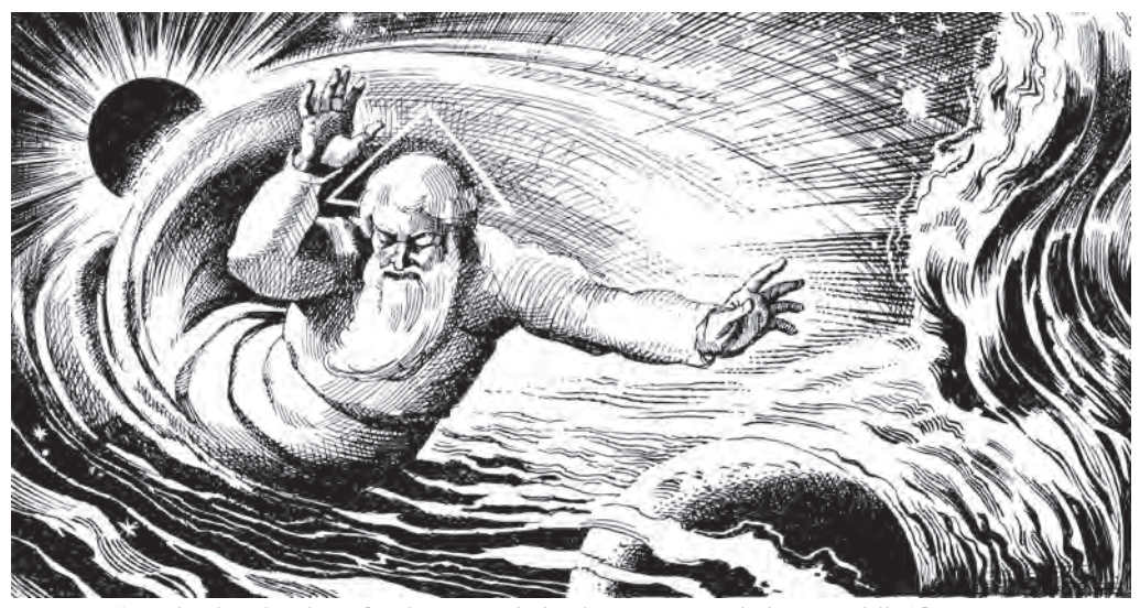
"In the beginning God created the heavens and the earth" (Gen 1:1).