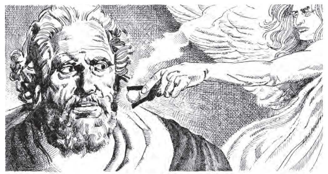
"Then one of the seraphim flew to me, holding in his hand a burning coal. . . . He touched my mouth with it and said: . . . 'your guilt has been removed' " (Isa 6:6-7).