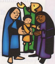
Presentation of the Lord