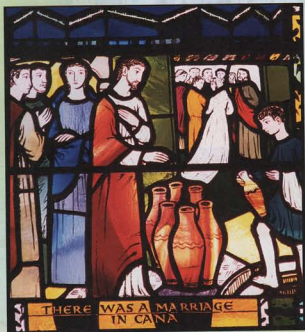
Wedding in Cana

What did Jesus do at the wedding in Cana?