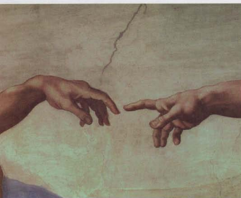
▲ Hands of God and Adam, detail from The Creation of Adam in the Sistine Chapel, by Michelangelo Buonarroti (1475–1564)

Because God wanted to have a relationship with humans, he made us different from the rest of his creation. You were made in God’s image and likeness, with a body and a soul —the spiritual principle in you that reflects God. With only a body, human beings would be like all the other animals. Because God has breathed his own divine Spirit into every human person, you are both a physical and spiritual being. You have an intellect that makes it possible for you to think, reason, and judge, and a free will —the ability to choose and make decisions on your own without being forced by instinct to choose or act in a certain way.