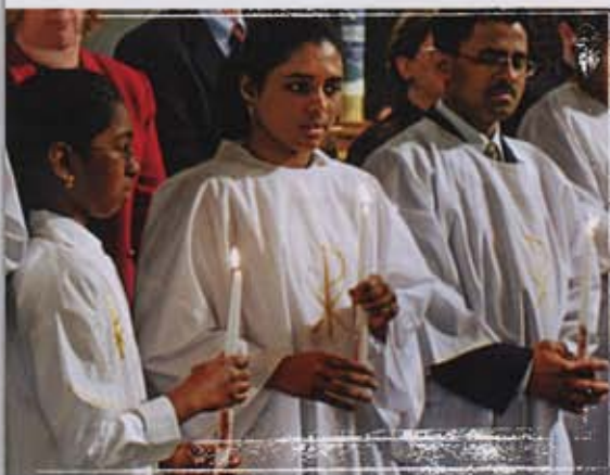
32 Fountain of Life

Newly baptized Catholics hold lit Baptism candles at an Easter Vigil Mass.