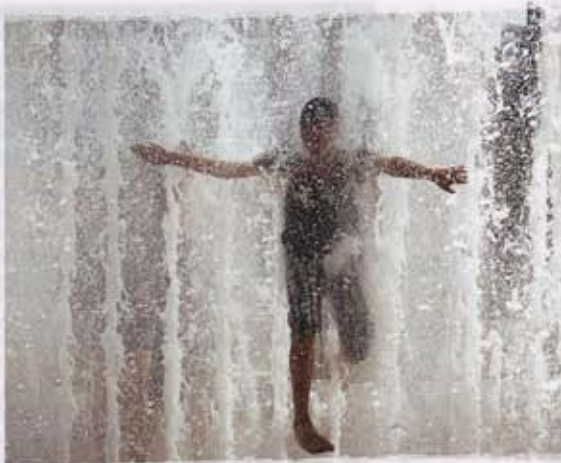
Water cleanses, nourishes, and replenishes us.

Recall Who generally administers the Sacrament of Baptism?