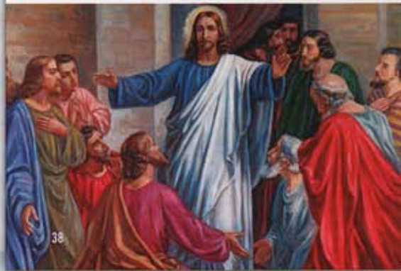
Jesus gives his Apostles the Great Commission to go and preach the Good News.

Explain How does Baptism enable us to be like Christ?