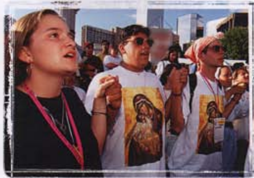
Young Catholics pray together at an event.

Close one of the class sessions with a Go to the Source feature meditation on 1 Corinthians 12:12-31—the Body of Christ. Have students assume comfortable positions, and then slowly and reverently proclaim the Scripture, pausing for moments of silence, or posing questions for reflection during the reading. Encourage students to reflect on what gifts they bring to the Body of Christ, and to carry that reflection into their personal prayer beyond the classroom.