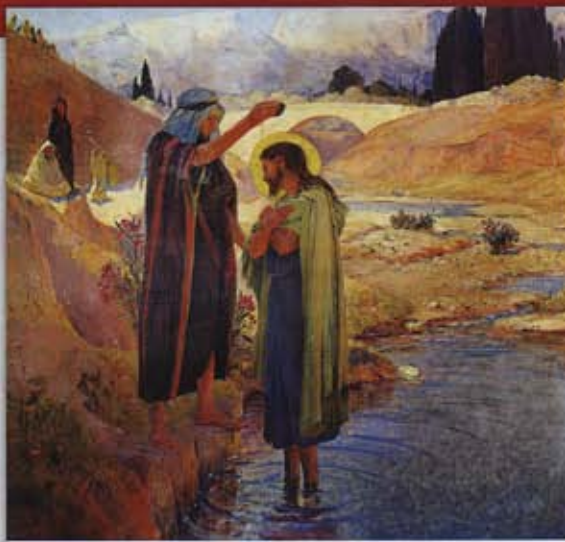
In this artistic depiction, Saint John the Baptist baptizes Jesus in the Jordan River.

Facilitate this activity with groups of eight students each. Have each group divide into four pairs. Each pair takes one of the four Scripture passages: Matthew 3:1-17, Mark 1:1-11, Luke 3:3-6, 21-22, and John 1:19-34. Their task is to read the passage, summarize the account, and identify truths of faith they learn. Then the pairs share their summaries with each other in the small group. Using newsprint and a marker, the small groups should compare and contrast the accounts, and reach consensus on three truths of faith they've identified in the process. Have each group present their work to the class.