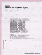
GUIDE PAGE 69

FYI Distribute Resource 2: Litany of the Holy Name of Jesus .