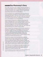
GUIDE PAGE 69

FYI Distribute Resource 2: One Missionary's Story .