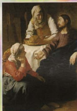
Jesus in the home of Martha and Mary

What do you know about what happened when Jesus visited the home of Martha and Mary?