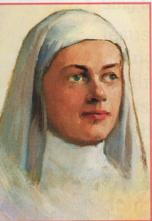
▲ Blessed Julian of Norwich, 1342–1420

Julian prayed to God as a Father and a dear Friend. She called God Mother and Brother, too. Julian said that the whole world was like a small hazelnut held in God’s hand. Everything would be just fine because God cares for everything and everyone. Julian spent her life in prayer, fasting, study, and counseling others. Her feast day is May 13.