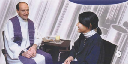
Catechism of the Catholic Church 2002-2003