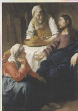
Jesus in the home of Martha and Mary

What do you know about what happened when Jesus visited the home of Martha and Mary?