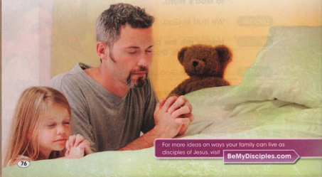
For more ideas on ways your family can live as disciples of Jesus, visit BeMyDisciples.com

The psalms are a profession of faith in song. From the time of David until the present, praying of the psalms has nourished the faith of the People of God. This prayer is both personal and communal. Memorize psalm verses such as the one on page 75 and pray them spontaneously to respond to the various circumstances of your life.