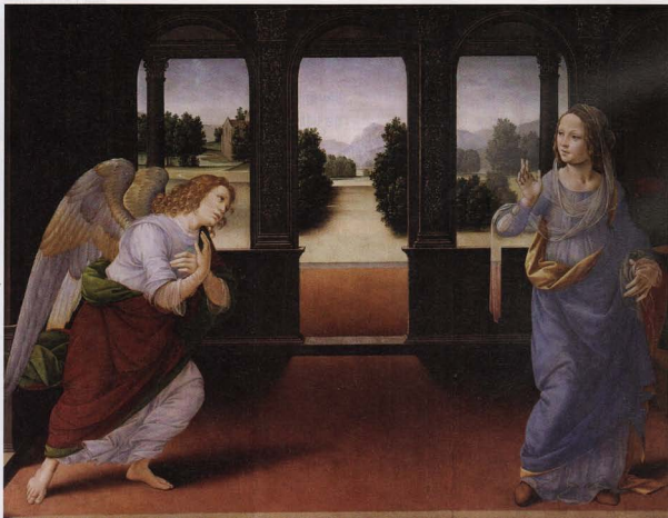
▼ Annunciation , by Lorenzo di Credi (c. 1459–1537)

God the Son became human to lead us back into a friendship with the Father and harmony with one another, to restore God’s creation. He comes to bring back all things to himself in love. But how does this great mystery of the Incarnation happen? How can it be that the almighty God who existed first and forever is revealed in Jesus?