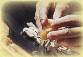
Jesus Who Provided Breakfast for His Disciples (See John 21:7-13 )

What do the passages and their images tell you about who Jesus is?