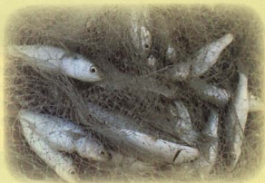
Jesus Who Worked Miracles (See Luke 5:1-11 )