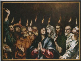
The Pentecost. El Greco (1541–1614), Greek-born Spanish painter.