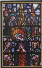
Pentecost, stained glass.