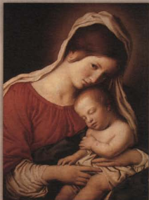
Madonna and Child, oil on canvas. Sassoferrato (1609-1685). Italian Baroque Era painter.

It was the Holy Spirit who prepared Mary to become the Mother of God and the Mother of the Church. Through the Holy Spirit, the Blessed Virgin Mary conceived and gave birth to Jesus Christ. The name Jesus means "God saves," and the name Christ means "Anointed One," or "Messiah." Jesus Christ is the Incarnate Son of God and the long-awaited Messiah and Savior of the world.