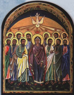
Pentecost, icon painted on wood. Artist unknown.