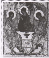
Trinity, Andrei Rublev, 1411 (tempera on panel, Moscow)

Throughout the Gospels, Jesus makes repeated references to God the Father, who calls us to share in eternal glory with him. In the following Scripture reading, Jesus tells his disciples that he will ask the Father to send the Holy Spirit to those who believe in him.