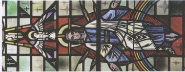
Three Persons in one God is the deepest mystery of the Catholic Faith.