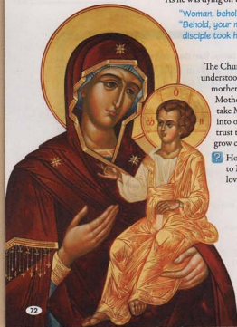
Mary and the Child Jesus, an icon at the Church of Mary Magdalene in Jerusalem, Israel